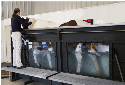
Fig. 3. Underwater treadmill.

The aquawalkers are mechanical walkers fitted within a circular pool that contains a consistent depth of water. The diameter of the aquawalker dictates how many horses can be exercised at a time; most systems are able to exercise six to eight horses simultaneously. Horses are not completely buoyant and are separated from each other by dividers creating an individual “pen” for each horse. The depth of the water is dictated by the system design; some have just a shallow trough with water maintained no higher than the fetlock joint, whereas others maintain the water height at the level of the stifle joint. The speed of system is controlled; however, unlike the underwater treadmills the horse may not walk at the consistent speed set by the unit. Some horses choose to slow down and then rush forward as the divider approaches them from behind only to slow down again once they catch up to the divider in front of them. Similar to the underwater treadmill units the aquawalkers are able to vary the water temperature and solute concentration.