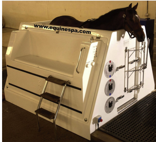
Fig. 2. Hypertonic cold water bath.